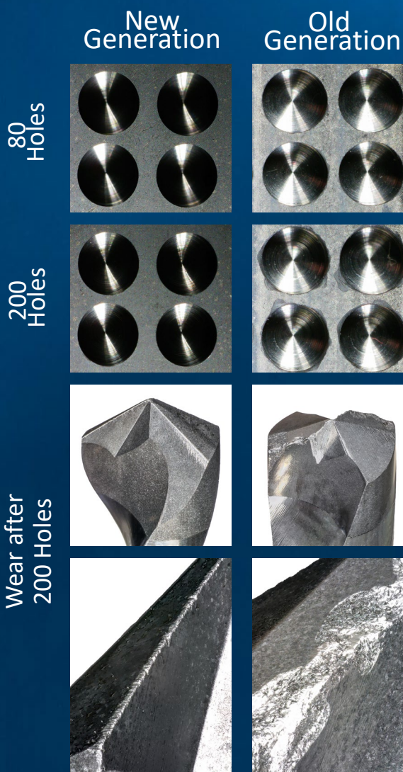
Tungsten Carbide K40-UF